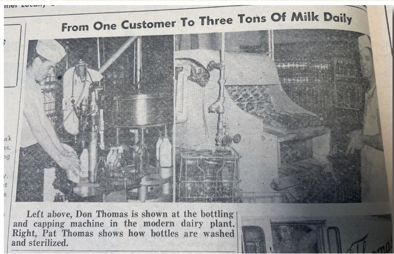
From One Customer To Three Tons Of Milk Daily