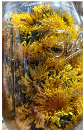
Mackenzie prepares a jar of dandelions to make a botanical oil. The dandelion salve is good for cuts and scrapes. It is also full of vitamins.