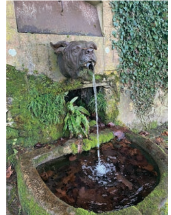
The memorial fountain in Belleau Wood, France remembering the Marine Devil Dogs.

To my brothers and sisters, I thank you for your service and commitment to this nation. To our Gold Star families, words cannot express enough gratitude. I would encourage everyone to take a minute to reflect upon how good we have it in this country. We are not perfect, and we disagree on many things, but I recall after 9-11 the resolve this nation can produce when we stand united.