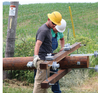
The pole in the photo background will be replaced with the pole that is being prepped for installation.

You'll see Jackson Electric's crews changing out poles when it fits into the construction schedule. They can also change poles during the winter months. They typically change out the pole when the line is energized, so a planned outage isn't necessary.