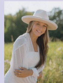
Joslyn Polenz Youth Ambassador Scholarship

"Whatever you choose for a career path, remember the struggles along the way are only meant to shape you for your purpose!"