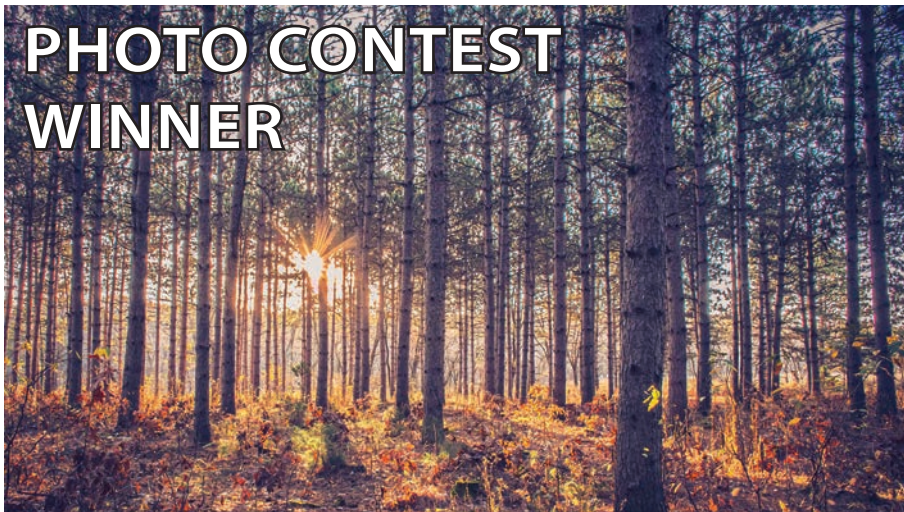
PHOTO CONTEST WINNER